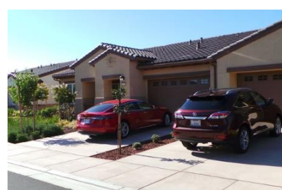
View of the SRC Clubhouse and the inner courtyard; The indoor swimming pool; Front view of our new home, showing the typical blue sky and newly planted trees.

Within a month we had emptied the boxes, mounted the pictures, learned the layout of SRC, become familiar with the neighborhood and settled into a new daily routine. Being an early riser, Susan took Missy for an hour walk at one of the nearby open fields in the Pleasanton-Dublin-Livermore tri-city region. When they returned, we all had breakfast at home. Susan would then go to swim class while I worked out in the spacious, well-equipped gym—all located within a few minutes' walk from our villa. Lunch at home would be followed by various activities; yoga, table tennis, sewing and computer work. I would then take Missy for another walk at a huge nearby sports complex, surrounded by large open fields, where she had a humiliating experience on the first day of our walk.