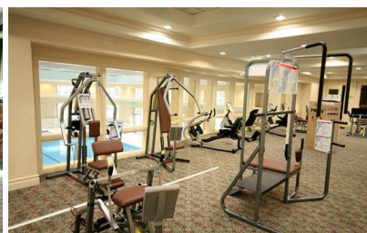
L to R: LCG facilities; One of the courtyards; One of the libraries; Fitness Center / indoor pool

Next, the saleslady took us through their large healthcare center, GlenBrook, that included Assisted Living, Skilled Nursing, and Memory Care. She explained that LCG residents may move freely to the GlenBrook when needs arise—without any fee increase. Recalling the problems some of our senior friends had faced as they pursued suitable and available care