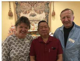
Bottom right: A former colleague, “The Giant,” (see page 127) visiting from Taiwan.