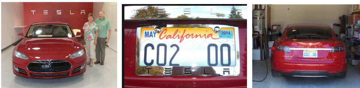
Picking up the car at the factory; Our custom license plate: Zero CO 2 ; Charging in our garage

Driving the Tesla was a real joy. The low center of gravity created a safe feeling through cornering. When we released the accelerator pedal, regenerative action slowed the car and simultaneously charged the battery. As we passed other cars on the highway, people often turned their heads to stare, because in 2013 Tesla was still a rare specimen. We quickly became the envy of our neighbors as well. The only mistake we made was not buying Tesla stock, because its price increased tenfold during the next four years!