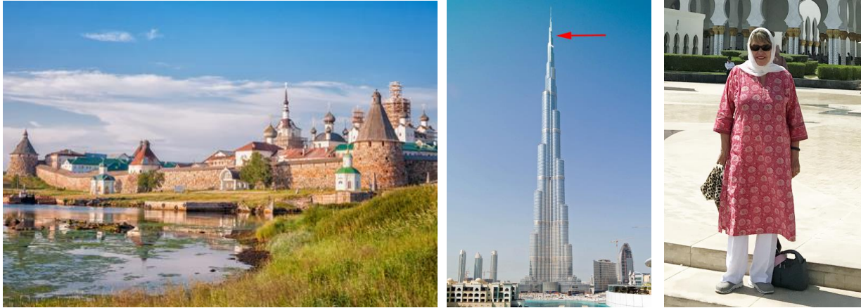
Impressive view of the former Soviet gulag; Burj Khalifa, 2,722 feet; Susan's "promiscuous" outfit.

knows how to spend our oil money; most of their skyscrapers have unique architectural designs, their roads are clean and smooth, trains are modern and quiet, and most of their automobiles are new. We've never seen so many luxury cars in any city before: Bentleys, Maseratis and Rolls Royces swarm all over.