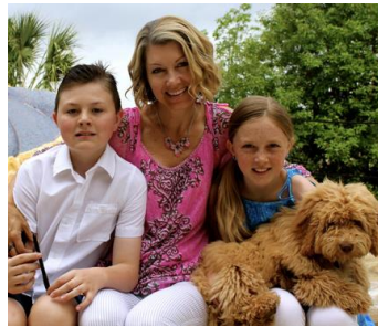
Left and top right: Two photos showing our five grandchildren, their parents, and the two family dogs.