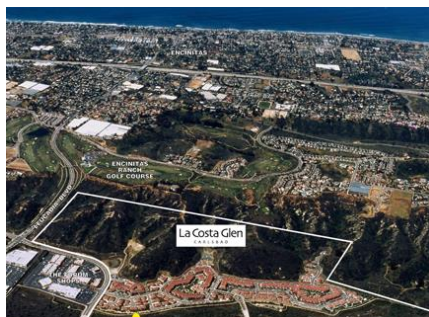
Aerial view of the La Costa Glen Retirement Community, located in Carlsbad about three miles from the ocean. The red tile-roofed buildings form a unique cluster with distinct Southern-California style. A convenient large shopping center is within walking distance, just across the street. (Our future villa is just above the yellow dot, near the bottom of the picture.)

An attractive and friendly marketing employee showed us around the facility. Instead of having only four-story apartment buildings like the Vi in Palo Alto, La Costa Glen (LCG) also offered various floorplans of two- and three-bedroom villas with attached garages. The community had about 850 residents; the restaurants, libraries, entertainment, and exercise facilities looked compatible to what we had seen at the Vi. The saleslady showed us different living units—both apartments and villas of various sizes. We appreciated seeing the units completely furnished and chatting at length with the residents. They all seemed to be happy and healthy, and they expressed their enjoyment of living at LCG. Susan and I were impressed with what we saw and heard.