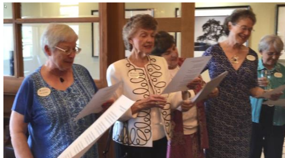
Photos taken at the sing-along farewell party