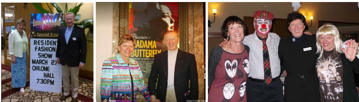
Dress-up events at SRC: Fashion Show; Opera; Halloween with neighbors, being Jack Lalanne.