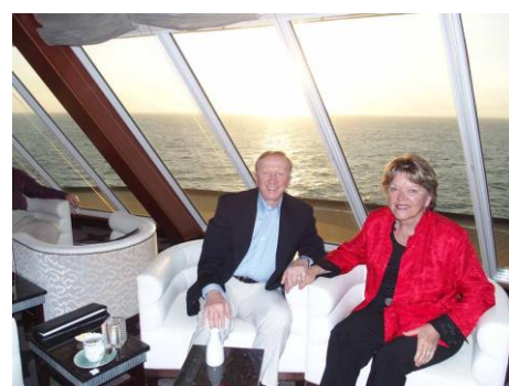
Warming on a heated bench in Bergen; Holding one of the captured king crabs; Sunset at 11pm.