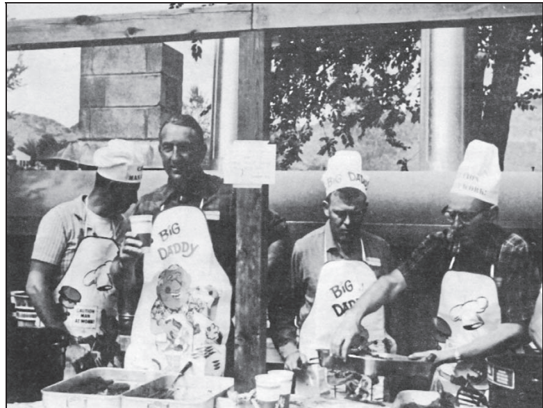
Bill Hewlett and Dave Packard at HP Loveland picnic in 1962. How many companies have founders that cook and serve their employees steaks?